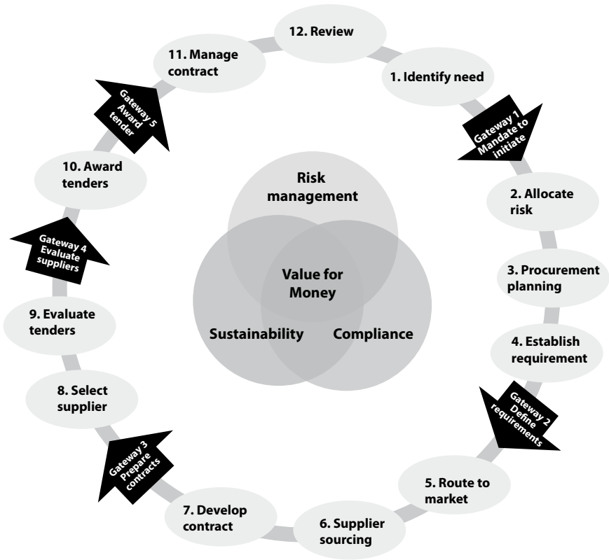
Figure 1: The Manchester procurement cycle